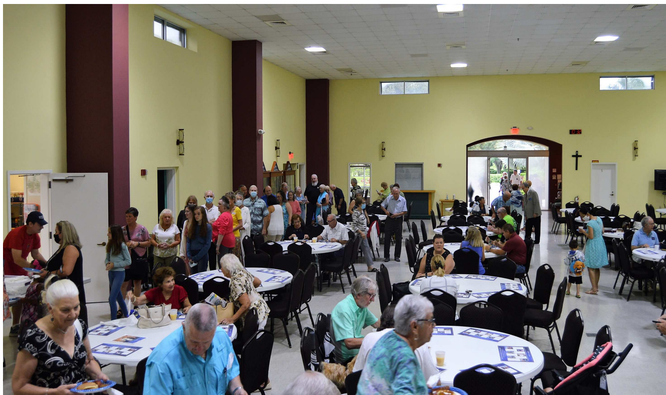
Parishioners lining up to consume their helpings of pancakes, bacon and sausage

The Pancake Breakfast served after all the Sunday morning Masses on that Sunday was a huge success! While there was a modest turn-out following the 7:30 Mass, the crowds overflowed at after both the 9:30 and 11:30 Masses! The last was a surprise for most as that Mass typically has low attendance for Breakfast. The majority of the attendees have consumed breakfast prior to arriving at the 11:30 Mass.