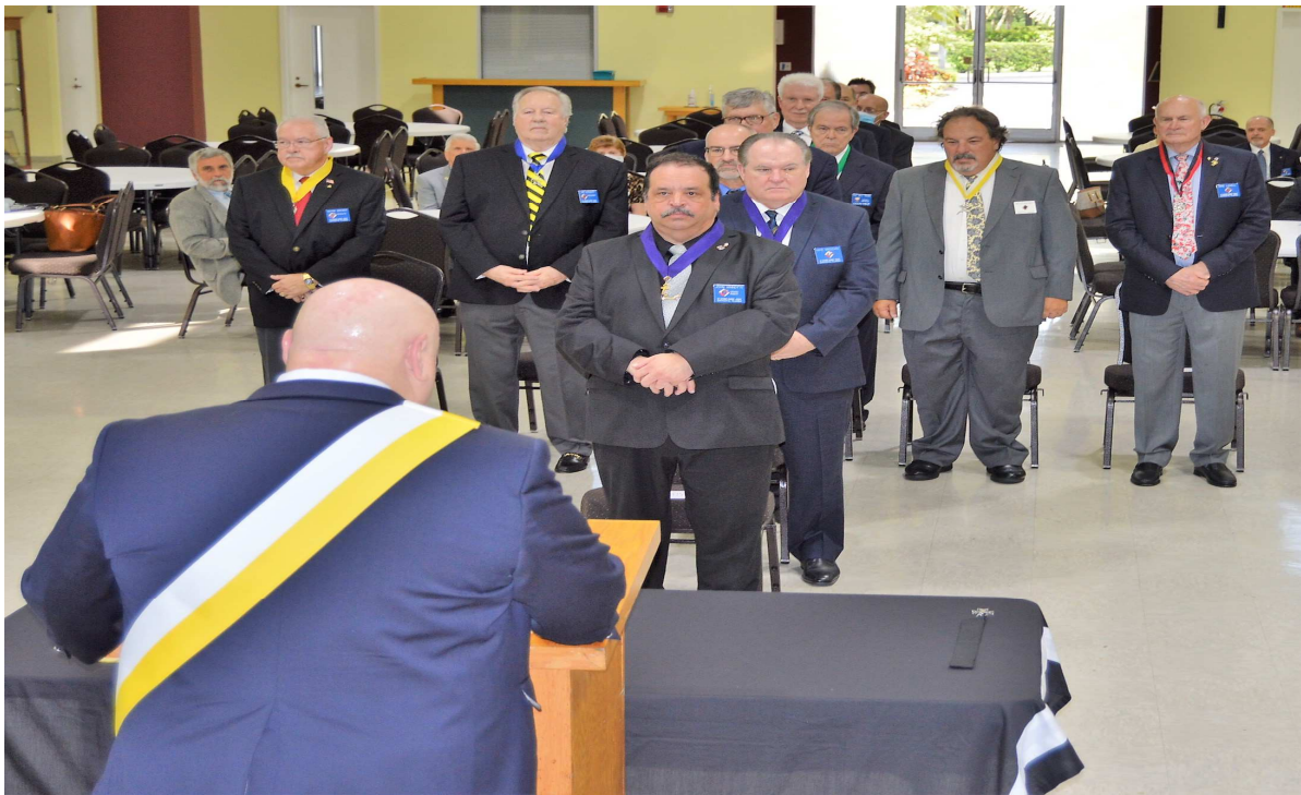
The Officers, aligned in the shape of a Cross, receive the charge of Officer from the District Deputy